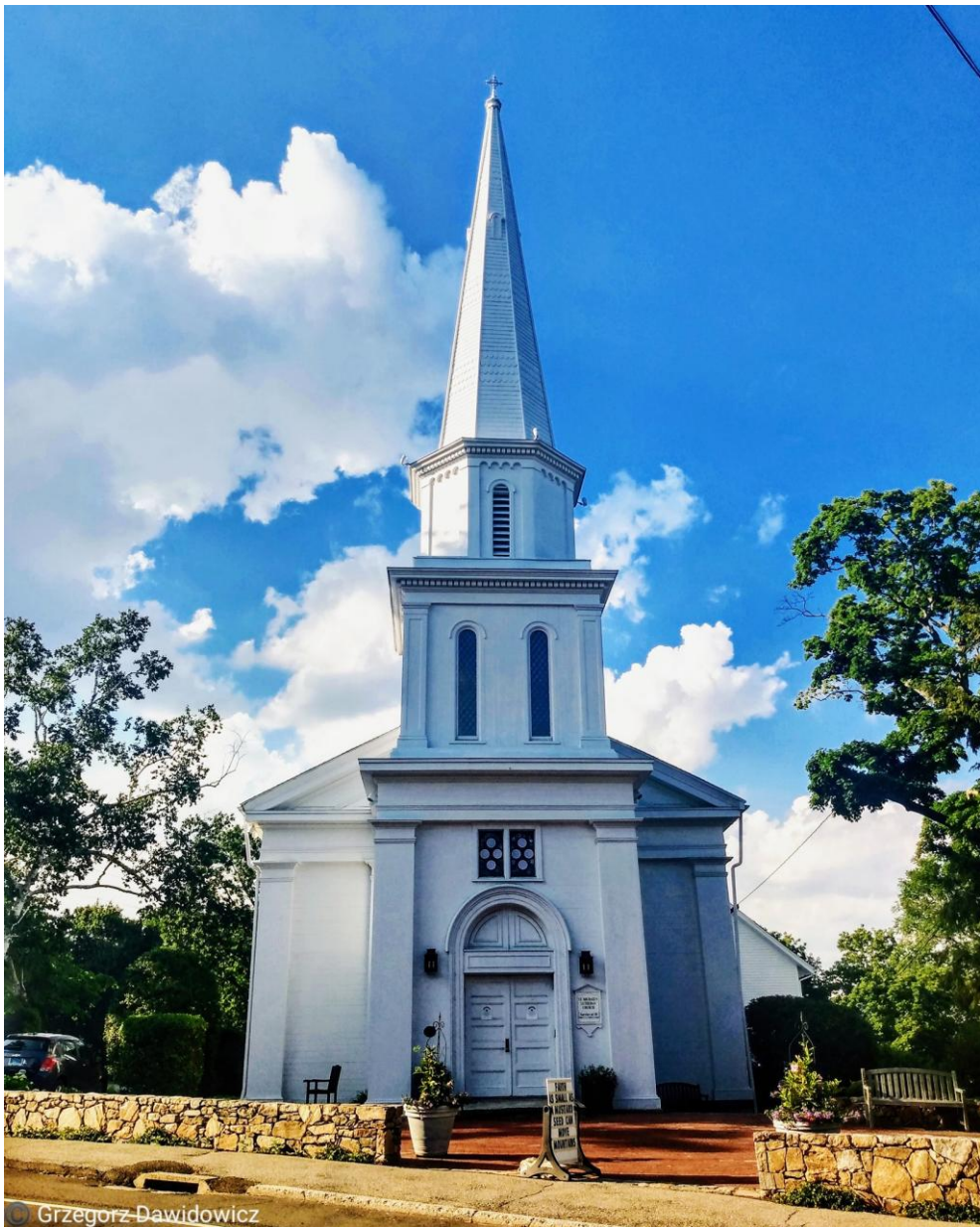
Saint Michael's Lutheran Church